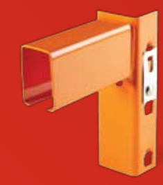
Channel beam. Excellent load carrying capacity and resistance to damage.