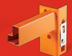
Stepped beam. Designed for longspan shelf storage.