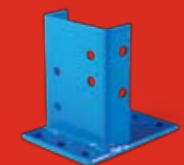
Heavy duty baseplate.