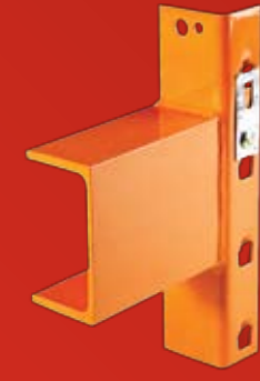
Channel beam. Excellent load carrying capacity and resistance to damage.