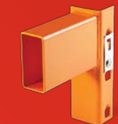
RHS beam. Excellent load carrying capacity and resistance to damage.