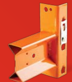
I-Beam. Don't pay for steel you don't need.