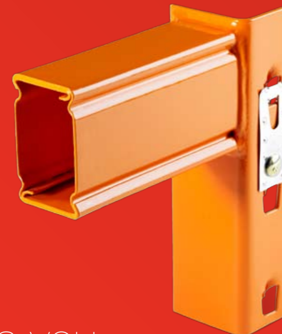
Box beam. Australia's market leader.

Dexion provides you with more component choices.