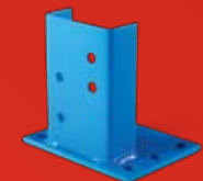
Narrow aisle baseplate.