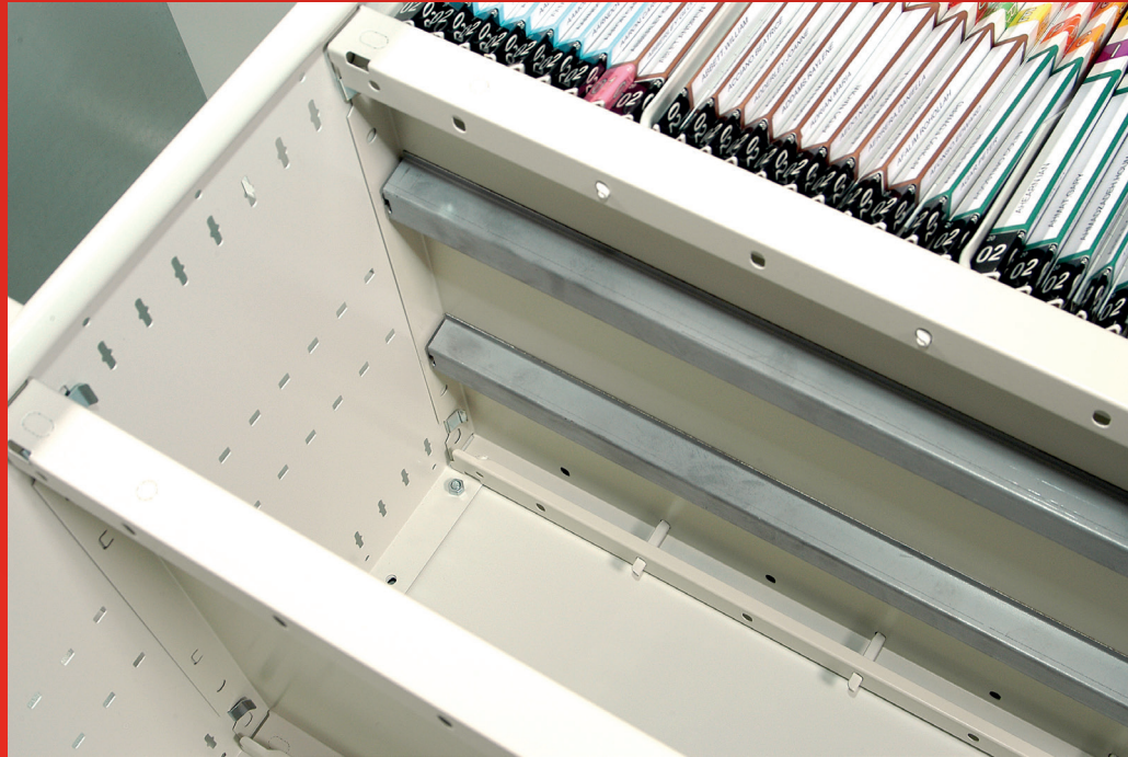
Shelf stiffeners increase shelf load carrying capacity. Additional shelf clip option for bays >600mm provides added strength.