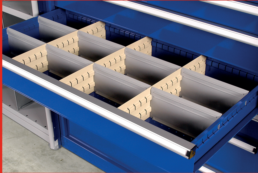
Incorporate Dexion-BAC drawer units for small parts storage.