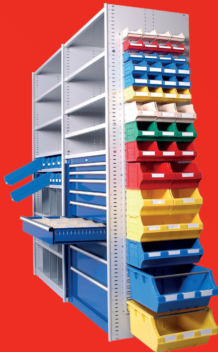
Incorporate louvred panels and hook style maxi-bins for a total solution.