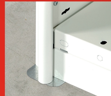
Base plates distribute load and protect floor coverings.