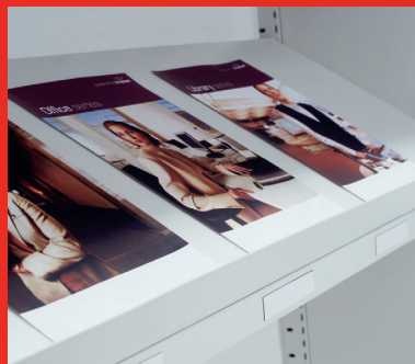
Display shelf and magnetic labels.