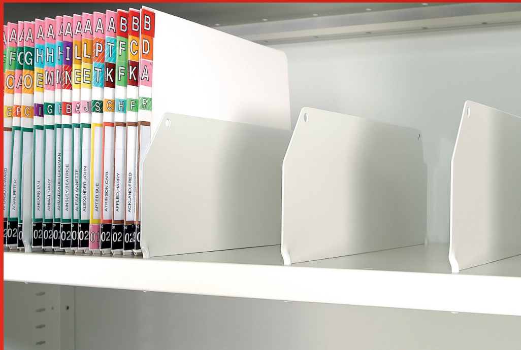
Slotted shelf allows for shelf dividers.