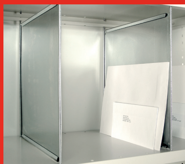
Create pigeon holes with binning dividers.