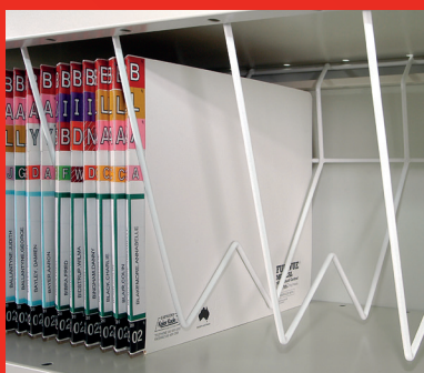
Suspended filing rack simply clips to the shelf and promotes longer lateral file life.