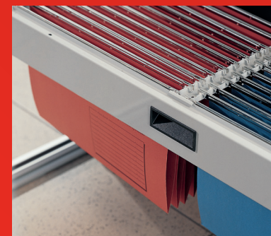
Suspension filing drawer is designed to suit drop-in suspension files.