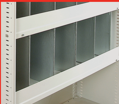
Bin fronts/back stops.