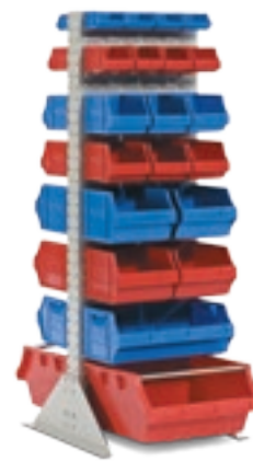
Louvred panel double sided with maxi bins.