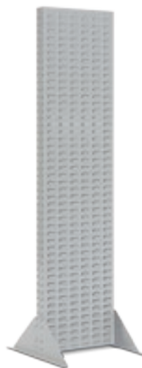
Double sided louvred panels, also available single sided for wall mounting.