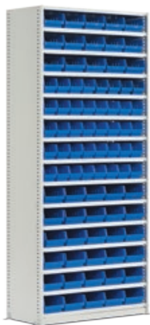
Ultima CI-80 with shelf bins. Shelf carrying capacity can be increased to 200kg UDL by adding shelf support.