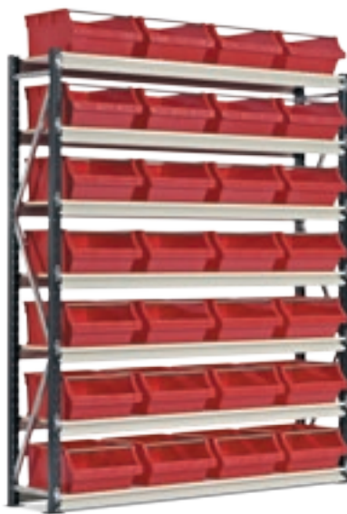
Ultima Longspan with particle board shelves and P60 Maxi bins.