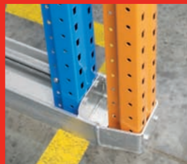
Floor channel Toe Up. Uprights are positioned inside the floor channel to protect them from forklift damage.

Self centring rails for perfect placement every time.