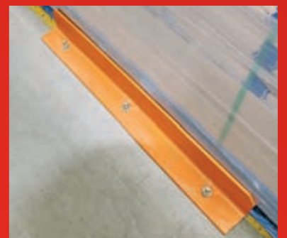
Floor mounted steel angles protect rear bracing, and visually aid the positioning of floor level pallets.