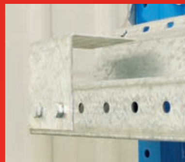
Pallet back-stops are used as a safety device to prevent loads unintentionally protruding beyond the back of the racking and damaging rear bracing.