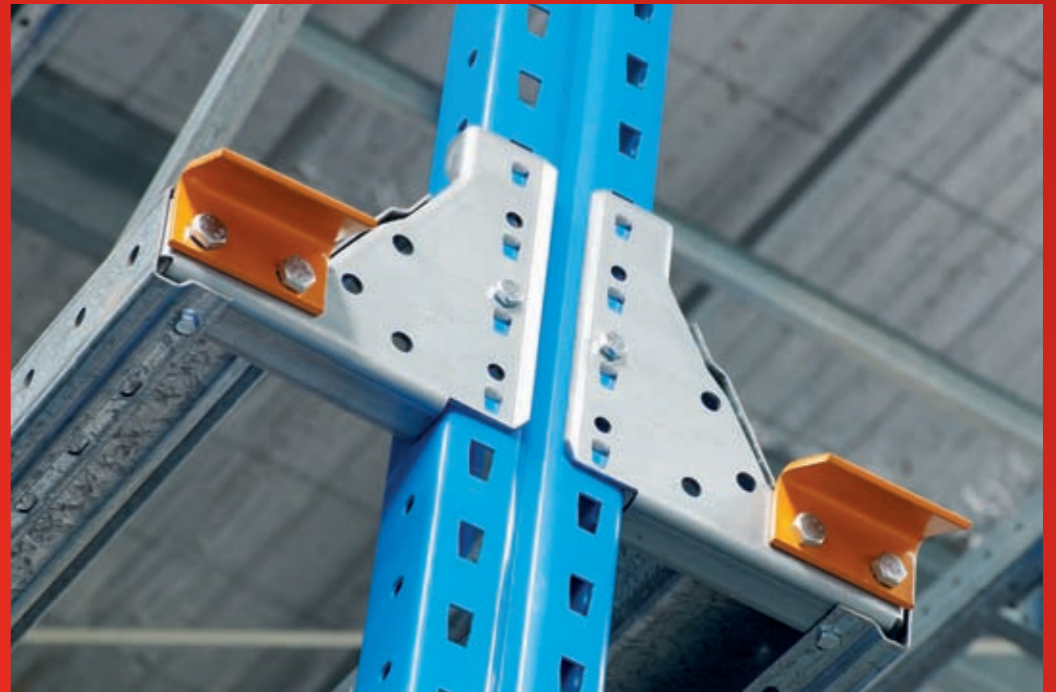
Lead in guides act as a visual aid for the fork lift operator to indicate the height of the rail and assist with the placing of pallets.