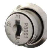
Cam Key Lock