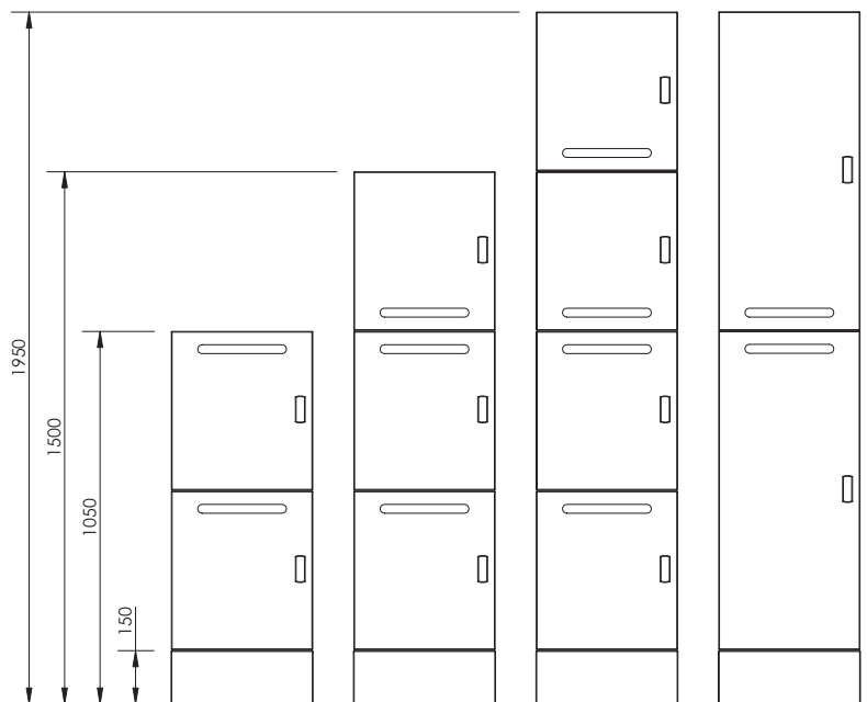
Kick-plate height is 150mm and add 16mm to heights when using a finishing top.

The Dexion Agile Lockers offer a wide range of flexibility and can be customised to meet the varied spaces and interior requirements of modern office spaces, provided an effective solution to personal storage. More information on the specification system is available via Dexion's sales support team.