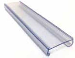
Shelf Label holders